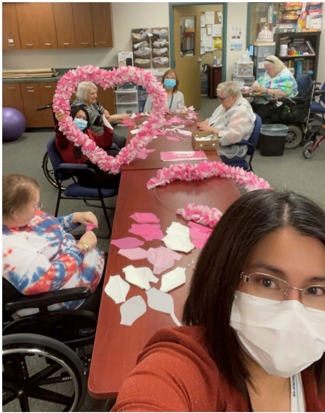
Love in is the air at AgeCare Sunrise Gardens!