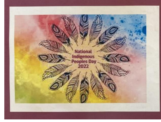
INDIGENOUS DAY DINNER THREE SISTER SOUP BISON SHEPHERD'S PIE BANNOCK OR HONEY GARLIC PORK CHOP MIXED VEGETABLE MASHED POTATO PEACH COBBLER

At AgeCare, we strive to provide person-centred and culturally appropriate care and services for